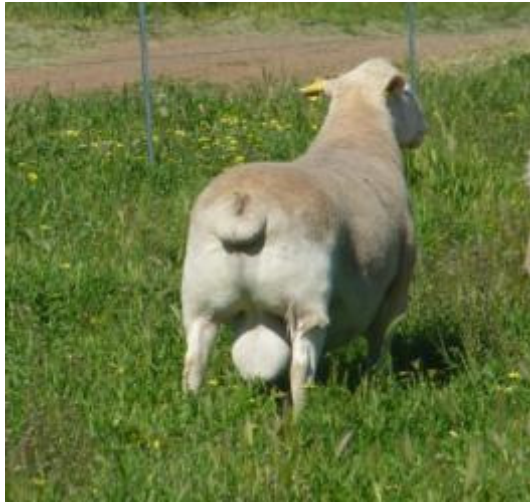
Wonoka Composite 698/13

Wonoka sires (from left Hillcroft Farms 8180/14, Hillcroft Farms 7565/14, Calena Heights registered A1 Wiltipoll 47/15 and Wonoka composite 698/13 (early Aug 2017)