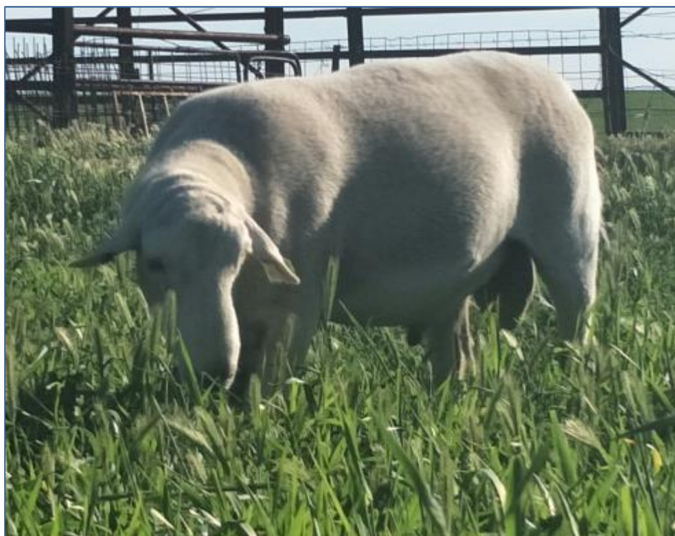
2016 Jayvee Farm rams 029/16 (top) and 028/16 (below), Oct 2017