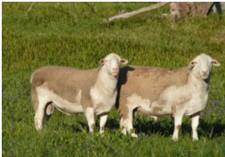
High performance Ultra Whites: Hillcroft Farms 8874/09 and Hillcroft Farms 9388/09