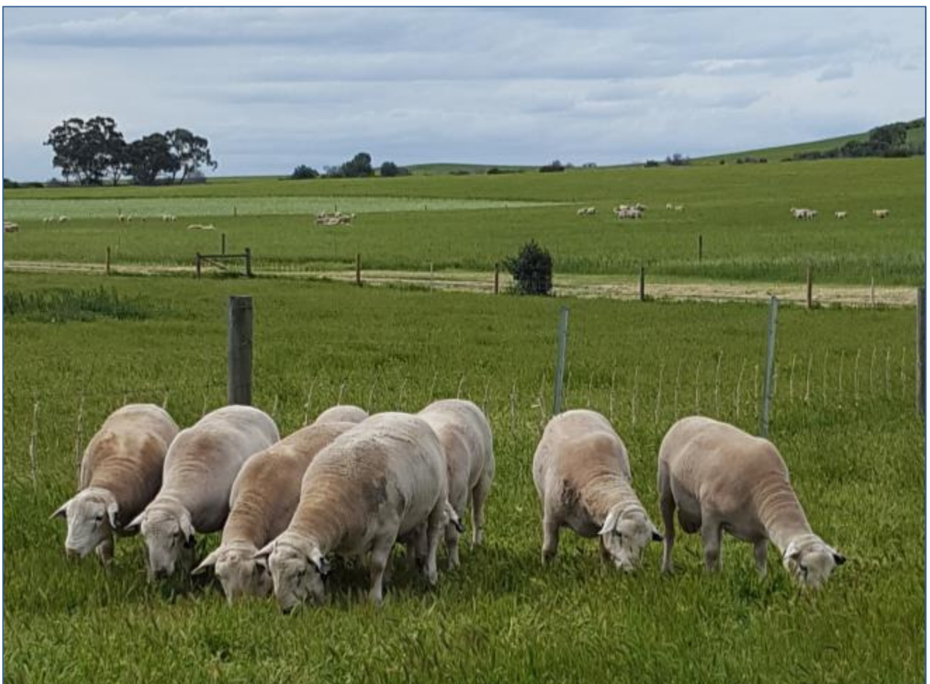
2016 Wonoka rams at 14 months (October 2017)