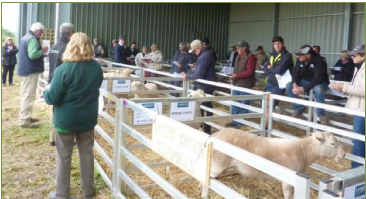
2016 on-farm sale underway – Spring Creek pen in the foreground